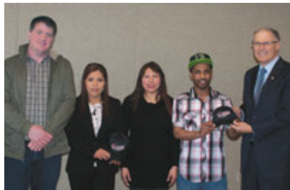
Students share with Governor Inslee how SVC is helping them reach their educational goals.

The tour wrapped up at Manufacturing , where he learned about the future of Manufacturing training that responds to employer needs. As the Governor exited Reeves Hall, he acknowledged SVC's Parks Law Enforcement Academy cadets who were standing at attention. After arriving at the Cardinal Center, students who are recipients of Opportunity Scholarships and State Need Grants , greeted the Governor and poignantly shared how SVC is helping them reach their educational goals. The day concluded with Culinary Arts student chefs preparing a Coho Smoked Salmon Ramen Salad for lunch, with whole wheat bread made with locally grown and milled flour.