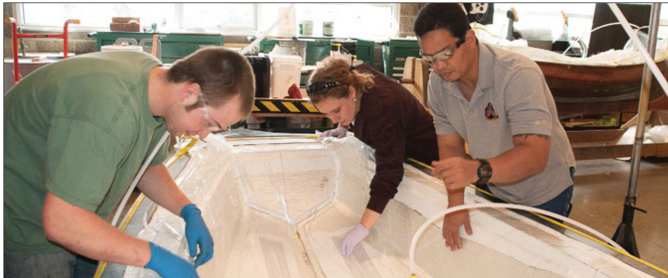
SVC is a member of the Composites Washington alliance. Students get high demand Composites training at the Marine Technology Center in Anacortes.

F rom aircraft to boats and wind turbines to sporting goods, Washington's rapidly growing composites industry is creating jobs that require skilled technicians. Skagit Valley College has teamed up with seven other community and technical colleges to form "Composites Washington," an alliance focused on strengthening workforce skills. Joining SVC are Clover Park Technical College, Edmonds Community College, Everett Community College, Olympic College, Peninsula College, Spokane Community College, and South Seattle Community College.