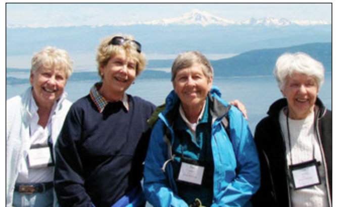
Road Scholar participants at the summit of Mount Constitution with surrounding islands and Mount Baker as a beautiful backdrop.

There are no grades or tests on Road Scholar programs. All that is needed is an inquiring mind, an adventurous spirit, and the belief that learning and discovery are lifelong pursuits. Established in 1975, Road Scholar