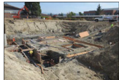
Workers are forming up for the footings that will be poured.